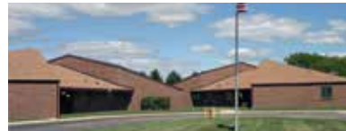
ELMWOOD HEIGHTS SPECIALIZED CARE FACILITY