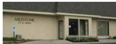
MILESTONE DENTAL CLINIC