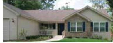
ADULT GROUP HOMES