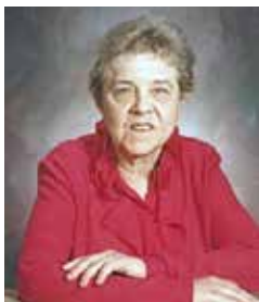
Enjoying Retirement 3