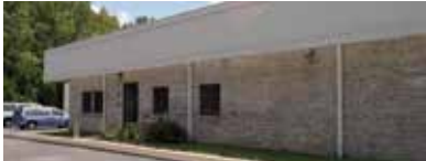
MILESTONE TRAINING CENTER