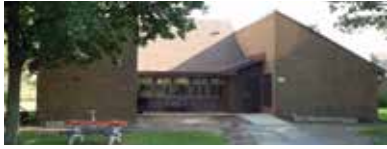
ROCVALE CHILDREN'S HOME